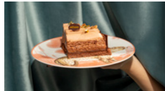
Delícia de Chocolate Chocolate Mousse Cake Chocolate e Creme Praliné Chocolate and Praline Cream