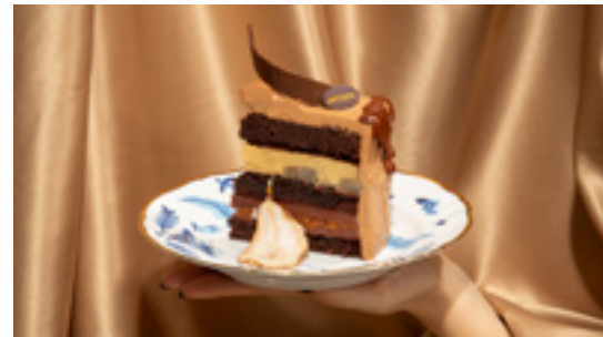
Chocoperas Chocoperas Chocolate e Cremoso de Pêra Chocolate and Pear Cremeaux