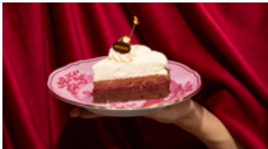
Floresta Negra Black Forest Mousse de Chocolate e Ginga Confitada Chocolate Mousse and Sour Cherry