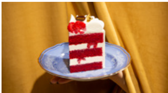
Red Velvet Red Velvet Framboesa e Creme de Queijo Raspberry and Cream Cheese