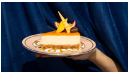
Cheesexotic Cheesexotic Geleia de Manga e Maracujá e Creme de Queijo Mango and passionfruit jam and Cream Cheese