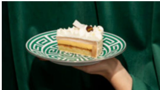
Cocolime Cocolime Mousse Praliné de Coco e Kalamansi Coconut Praline Mousse and Kalamansi